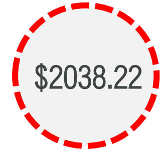
Final 2026 Total 30-Day Rate