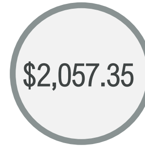
Final 2025 Total 30-Day Rate

Includes -0.1% outlier adjustment, -0.9% permanent behavioral adjustment, -2.7% temporary behavioral adjustment